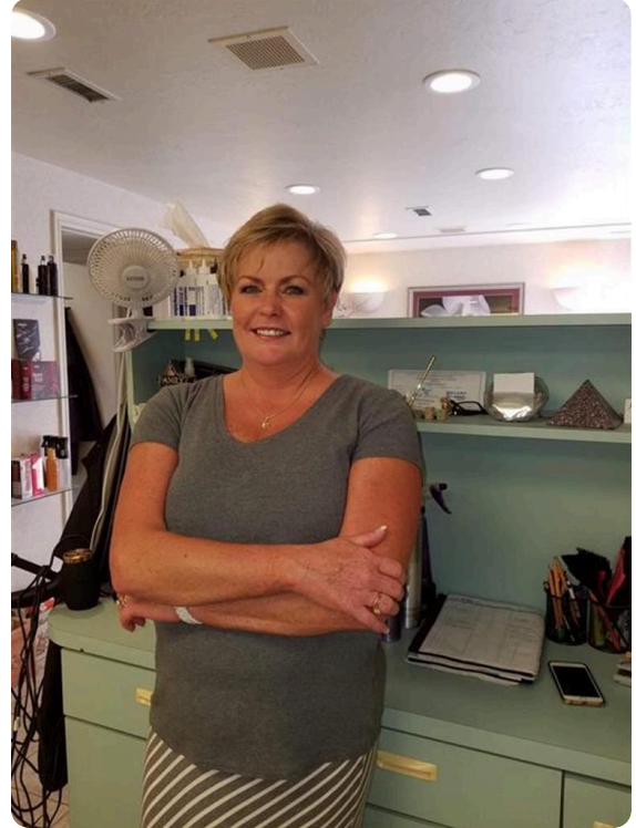
Beautiful lady on the inside and out