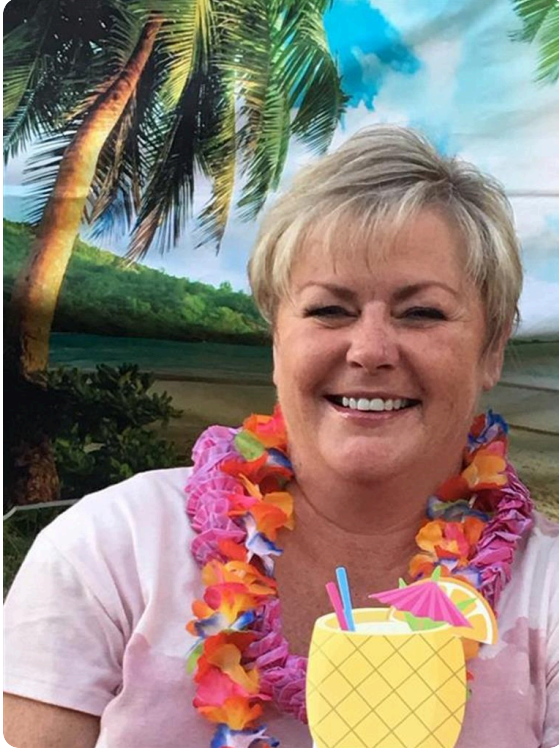
Eagle Cliff Ward Relief Society will miss you so much.